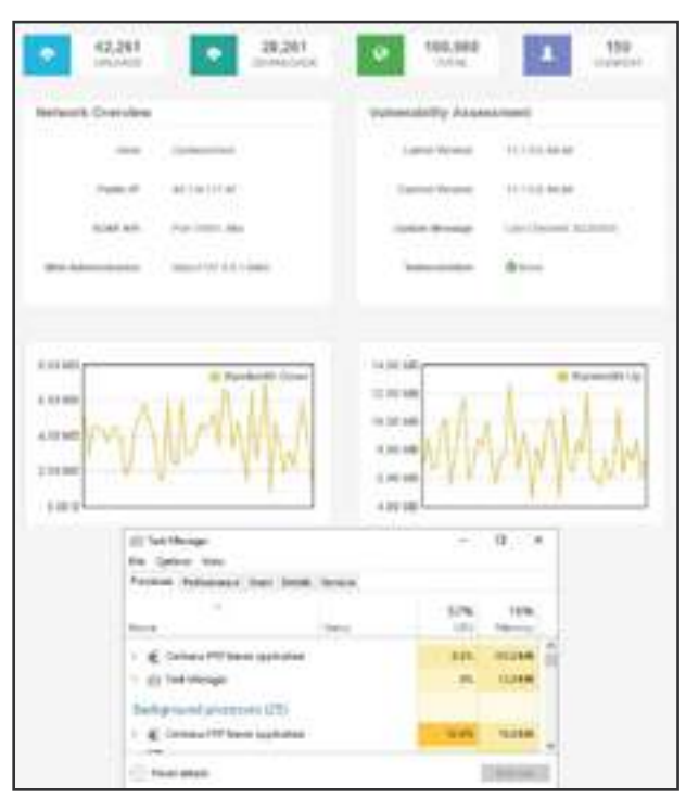
Test Two (Azure): Screenshot of the Cerberus Uploads, Downloads, Total Connections and Current Connections